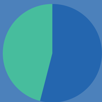
Male speakers (54%) Female speakers (46%)