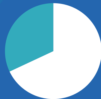
Male speakers (68%) Female speakers (32%)